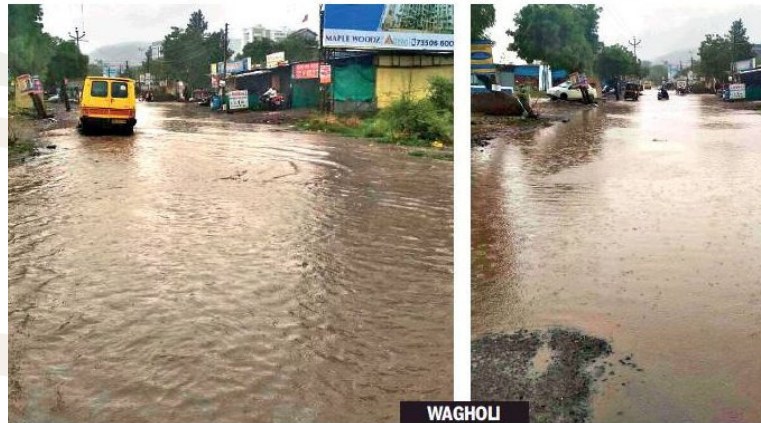
DW CLAIMS: The civic authorities have been claiming in the run-up to the rainy season that they are monsoon prepared. But heavy shower left the entire Bakori road inundated. It was a pain for the pedestrians and also the motorists to use the road year it's the same story. Why do the authorities make such claims? – Siraj Dokadia