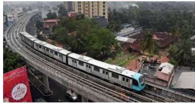
Pune metro extention till Wagholi