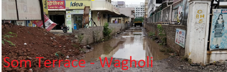
Som Terrace - Wagholi